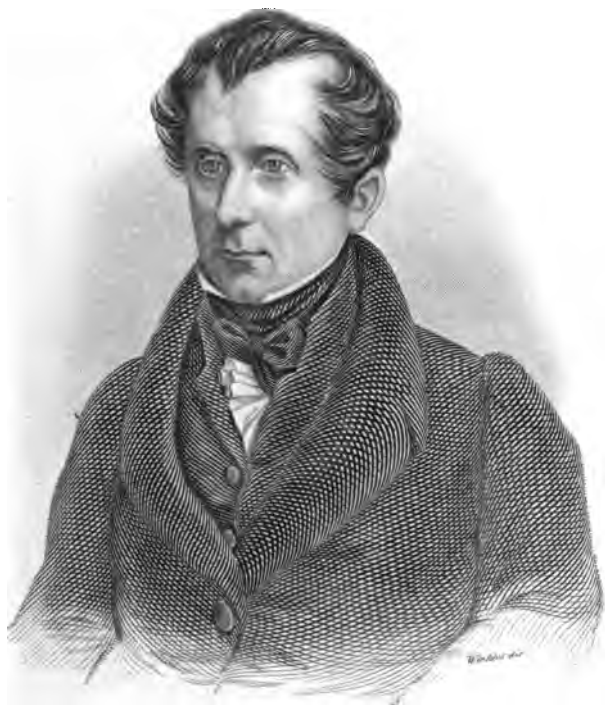
J. FENIMORE COOPER.